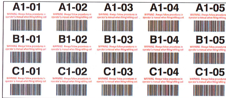
Sample Cell Location Labels

ScriptPro furnishes an initial quantity of these labels in sheets containing printed cell locations and barcodes, as shown in the example below. To purchase additional cell location label sheets, call ScriptPro Customer Service or see the ScriptPro Supplies Catalog on our website at www.scriptpro.com .